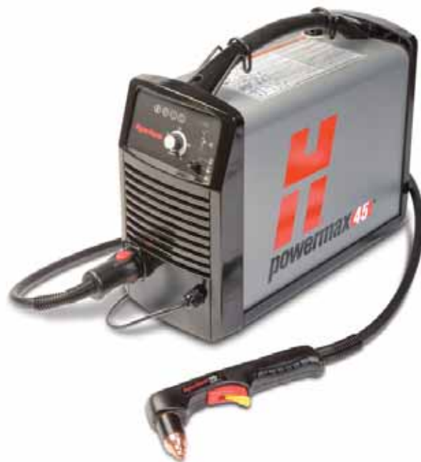
T45v hand torch